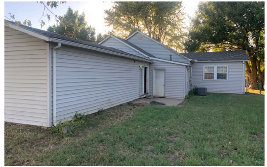
Rear of house